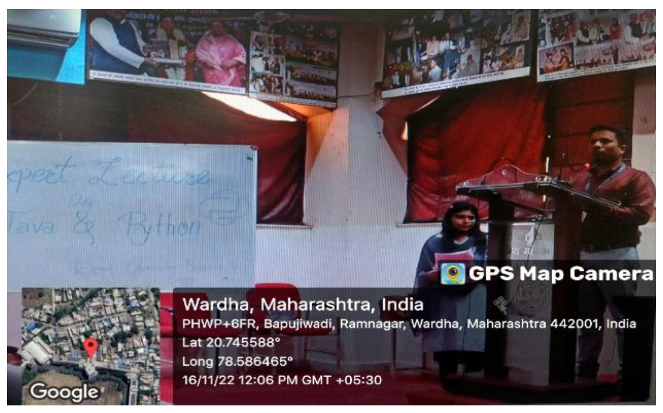
Event 2 Photos of "Trending software Languages on Java and Python" on date 16/11/222 by CSE Dept.